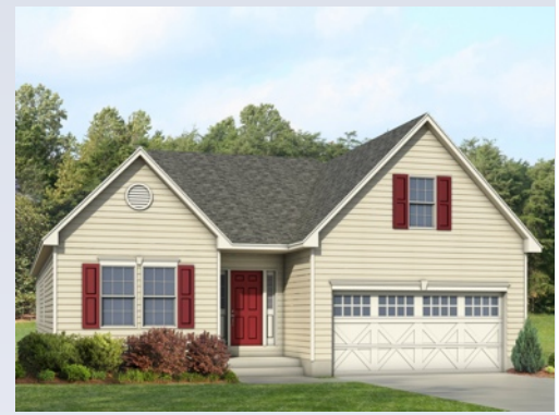
Elevation C w/Opt. Bonus Room