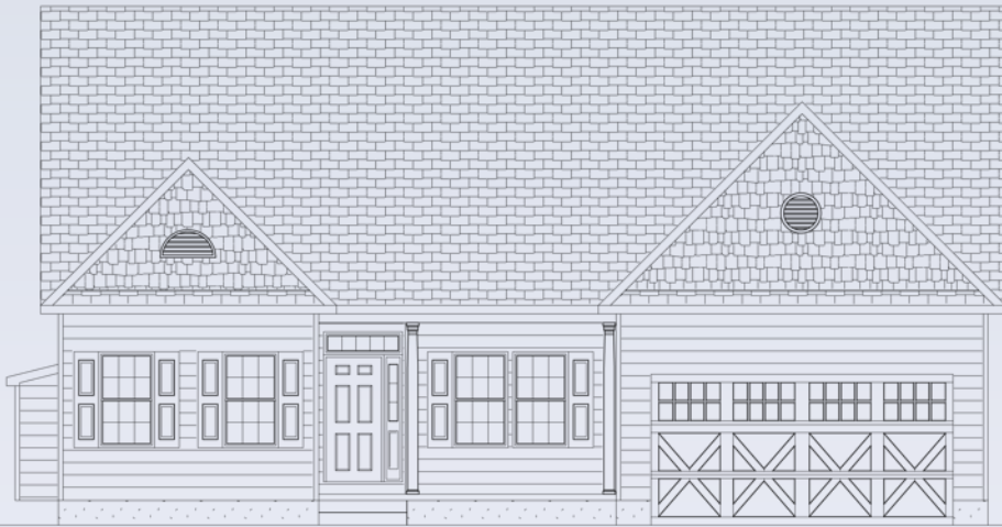
Elevation A (preliminary)