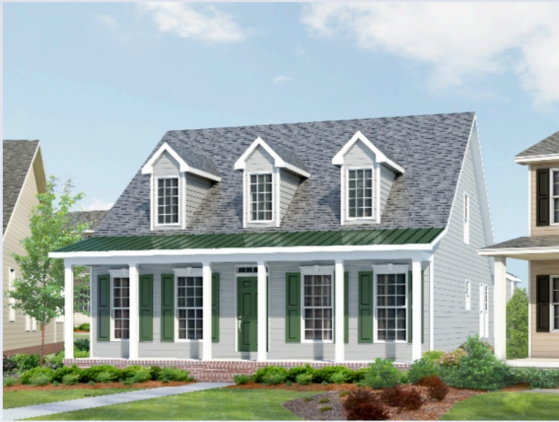
Elevation w/Optional Front Porch and Optional Metal Roof