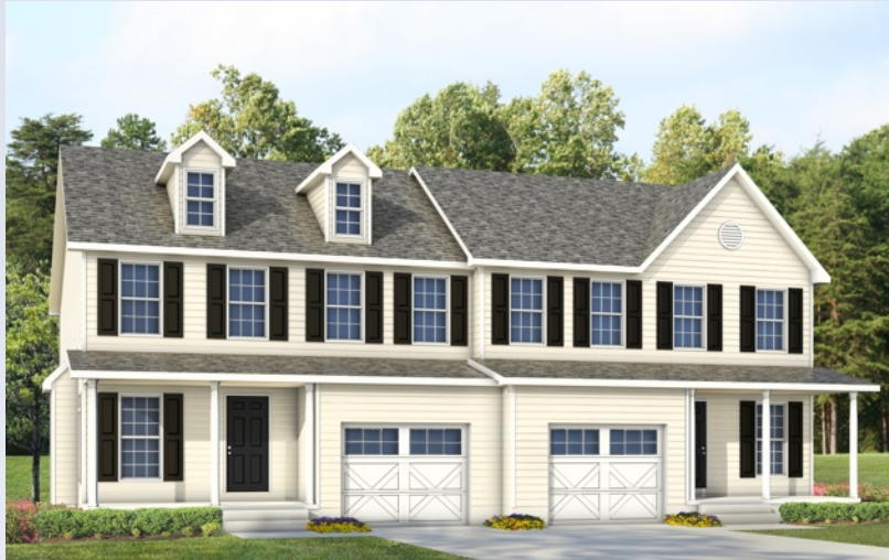
UNIT "B" UNIT "A"