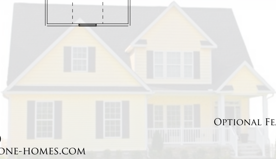
SECOND FLOOR PLAN OPTIONAL FEATURES MAY BE SHOWN