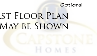
FIRST FLOOR PLAN OPTIONAL FEATURES MAY BE SHOWN