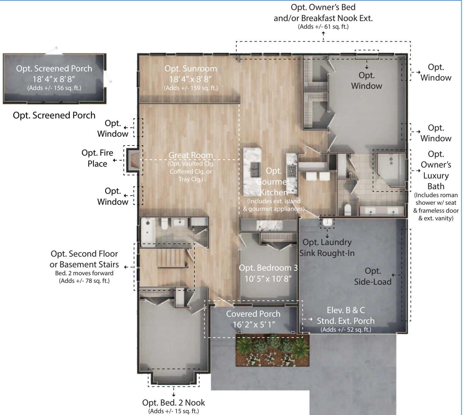
FIRST FLOOR - UPGRADES

3-5 Br | 2-4 Ba | 2-Car Garage | 1835 +/- Heated s.f.