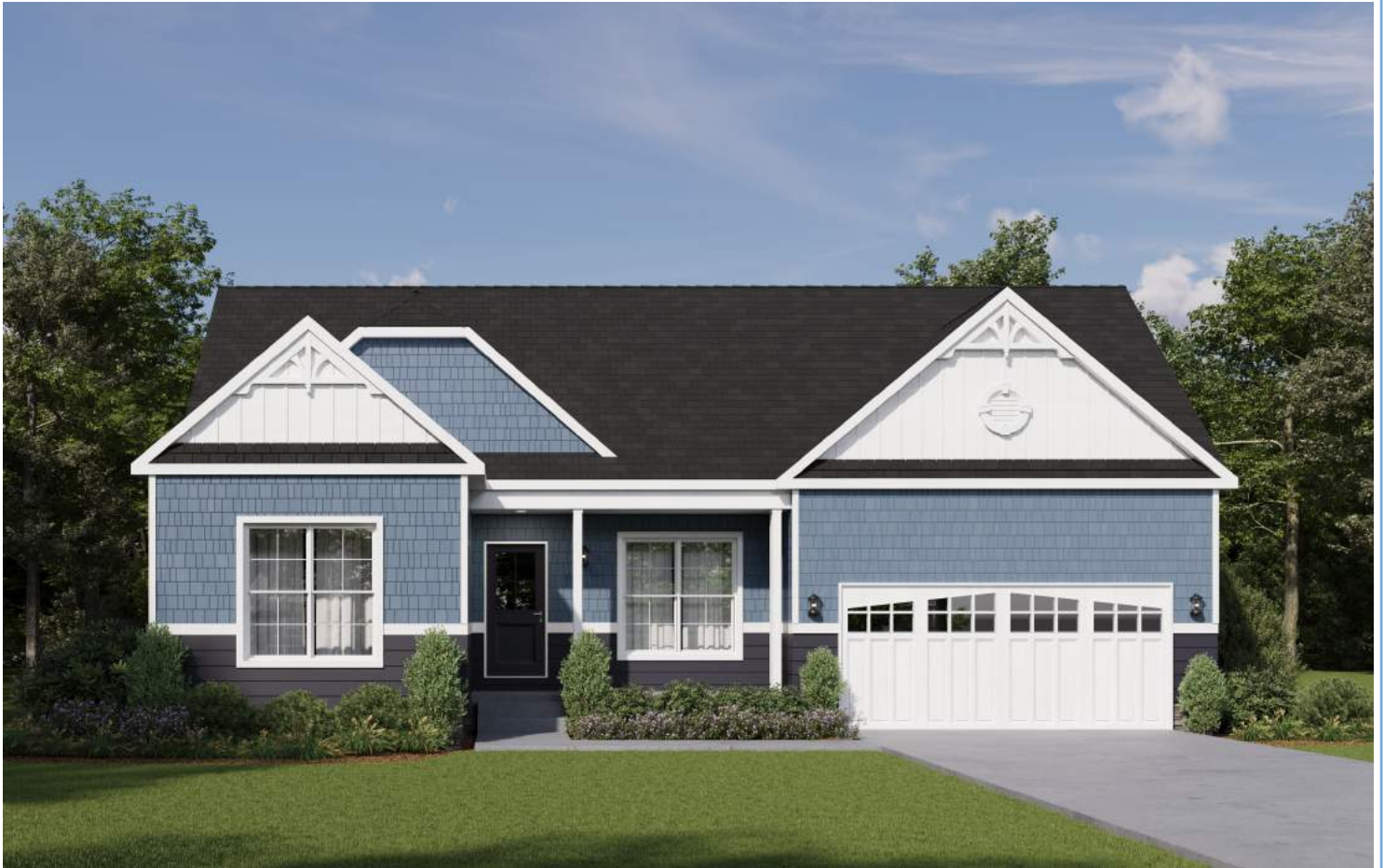
Elev. B: Shown with optional exterior features