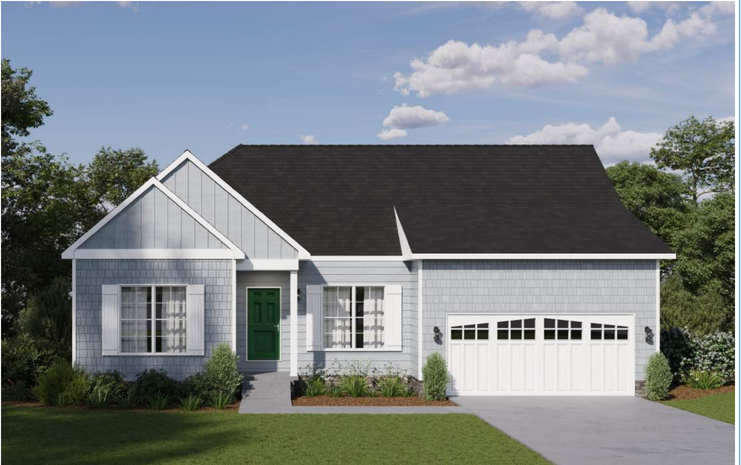
Elev. A: Shown with optional exterior features