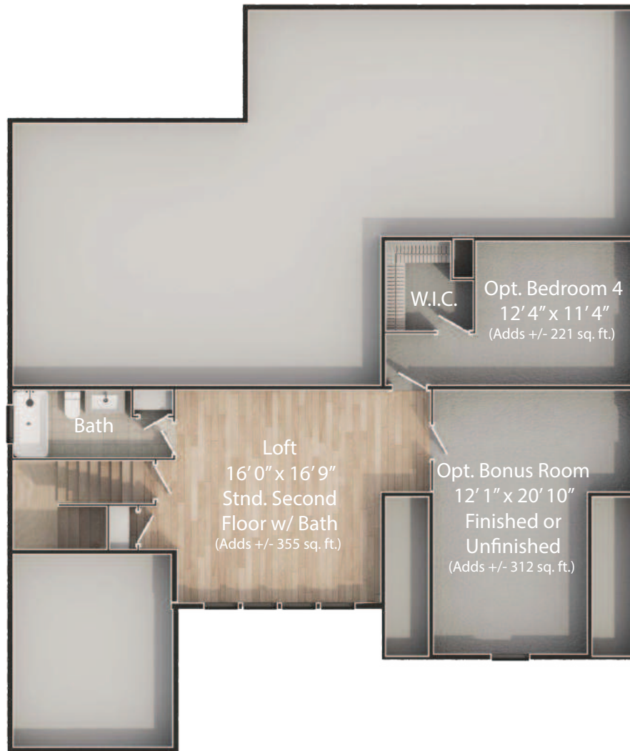
OPT. SECOND FLOOR