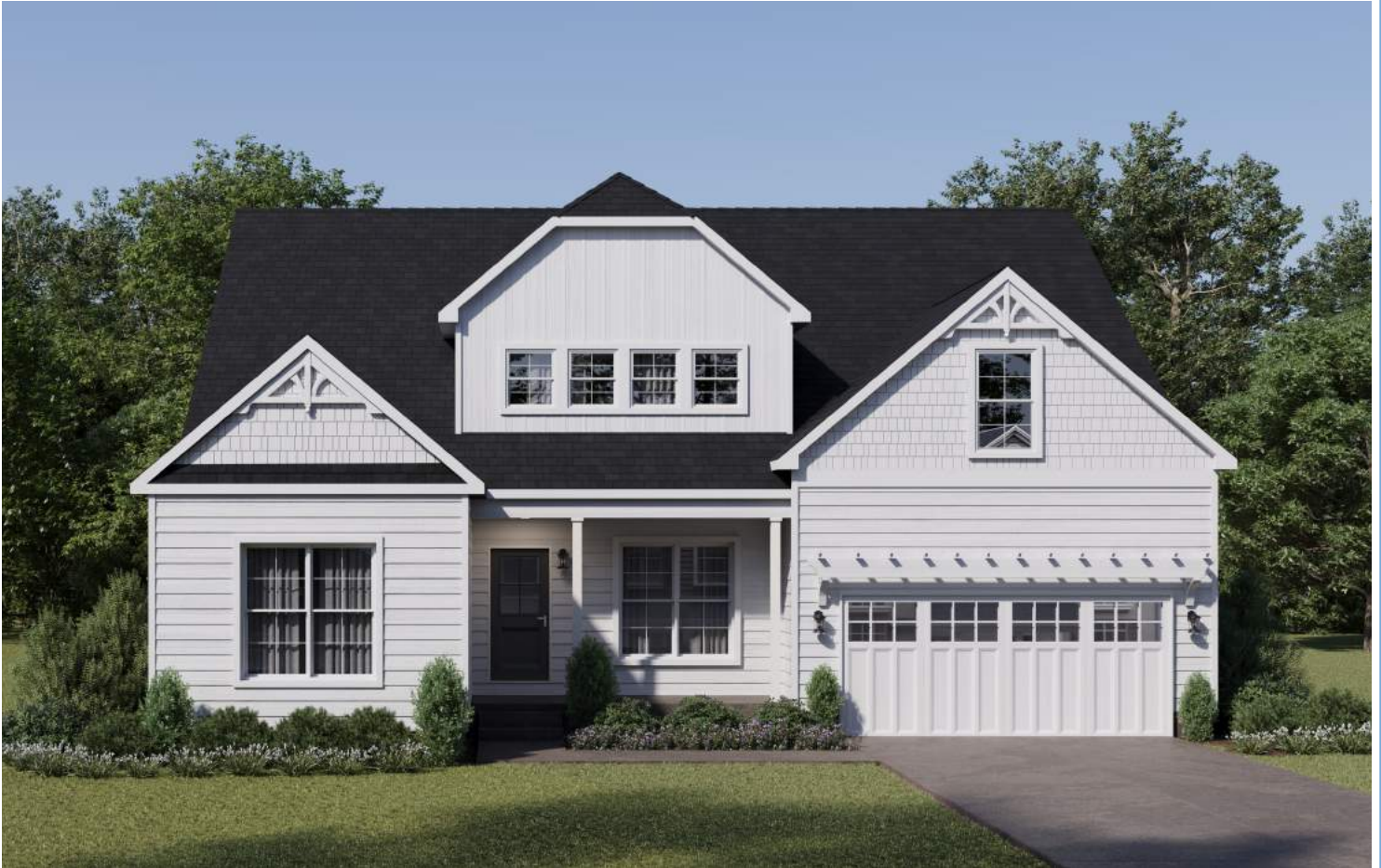
Elev. B w/ 2nd Floor Opt. : Shown with optional exterior features