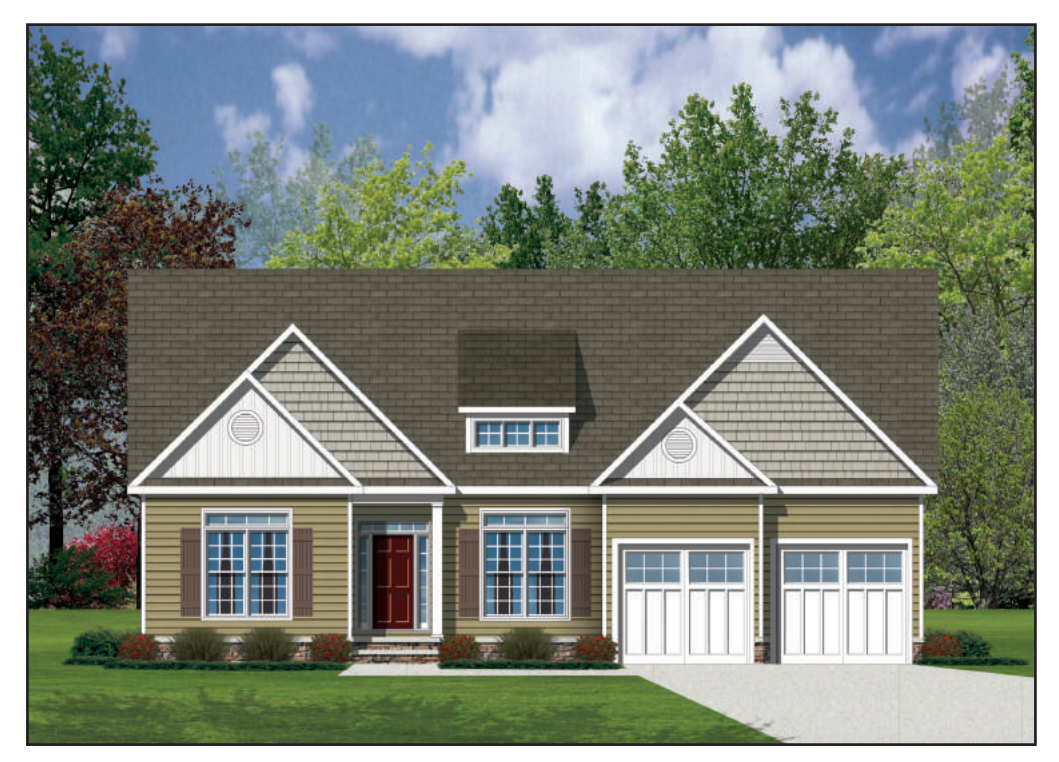
Elev. B: Shown with optional exterior features