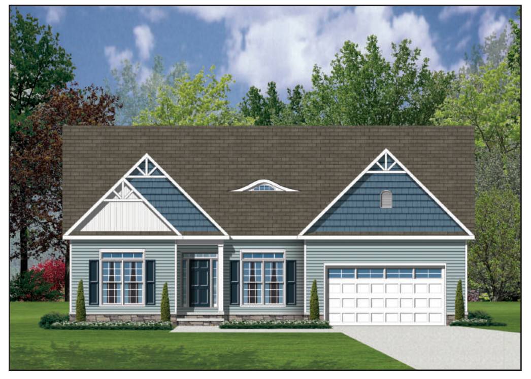
Elev. A: Shown with optional exterior features