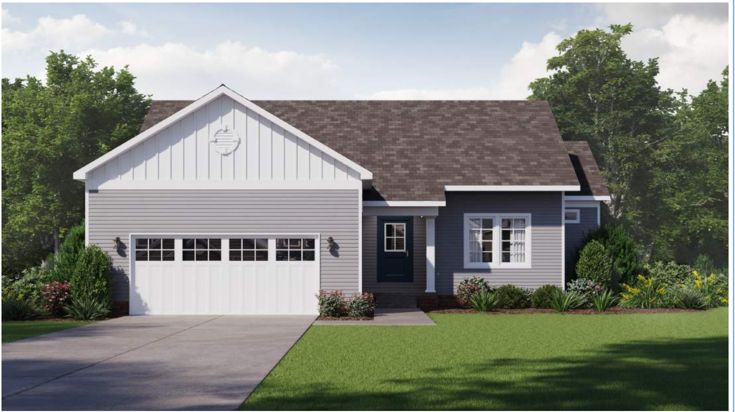
Elev. A: Shown with optional exterior features