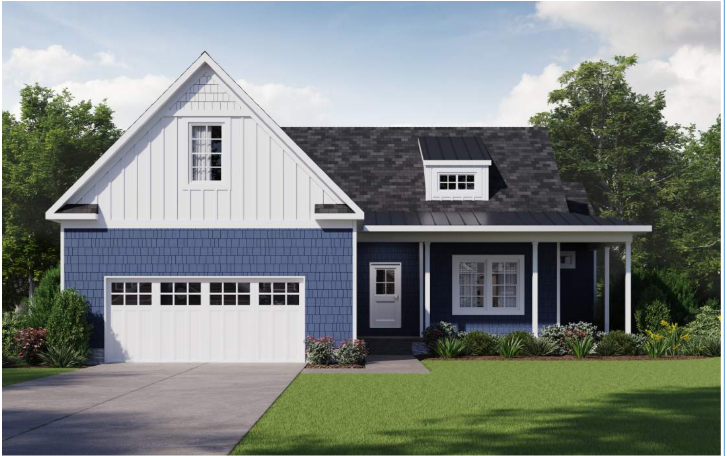
Elev. C: Shown with optional exterior features