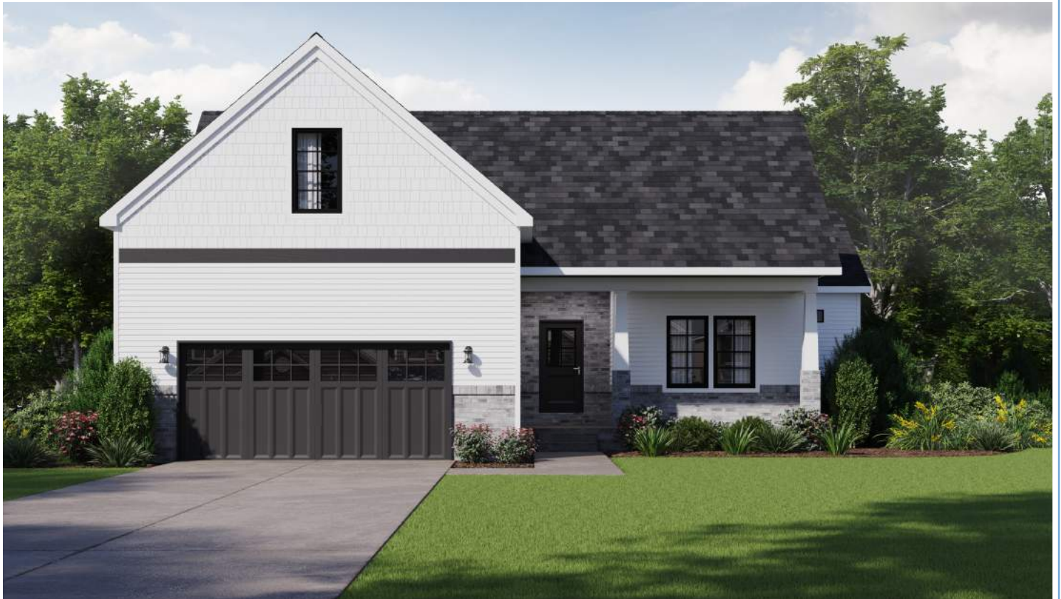
Elev. B: Shown with optional exterior features